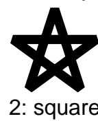
Figure 2-22: different line join styles

The line cap setting, adjusted using the setLineCap method, determines whether a terminating line ends in a square exactly at the vertex, a square over the vertex or a half circle over the vertex.